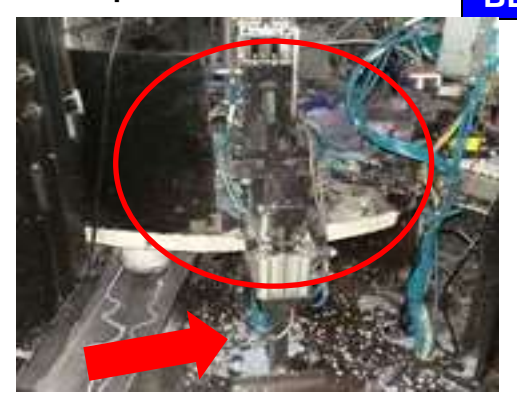
WHY - WHY ANALYSIS :-

PROBLEM / PRESENT STATUS :-Chips fall on shop floor from SPM m/c. BEFORE