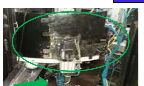
RESULT :-Eliminated chips falling on shop floor

COUNTERMEASURE:- Now we provide guard On the m/c.