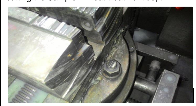
WHY - WHY ANALYSIS :-

Vice of cutting machine was being damaged due to frequently cutting the Sample in Heat-treatment dept.